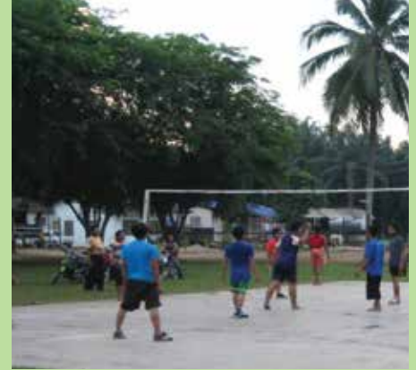
A volleyball court is one of the many leisure facilities available to workers.

One example of support for local communities was the construction of a mini hydro power generation project in collaboration with the Sabah Electricity Board. Another example was the donation of water tanks to the local community.