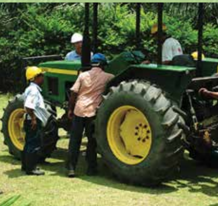
Plantation workers are given regular training and refresher courses on health and safety.