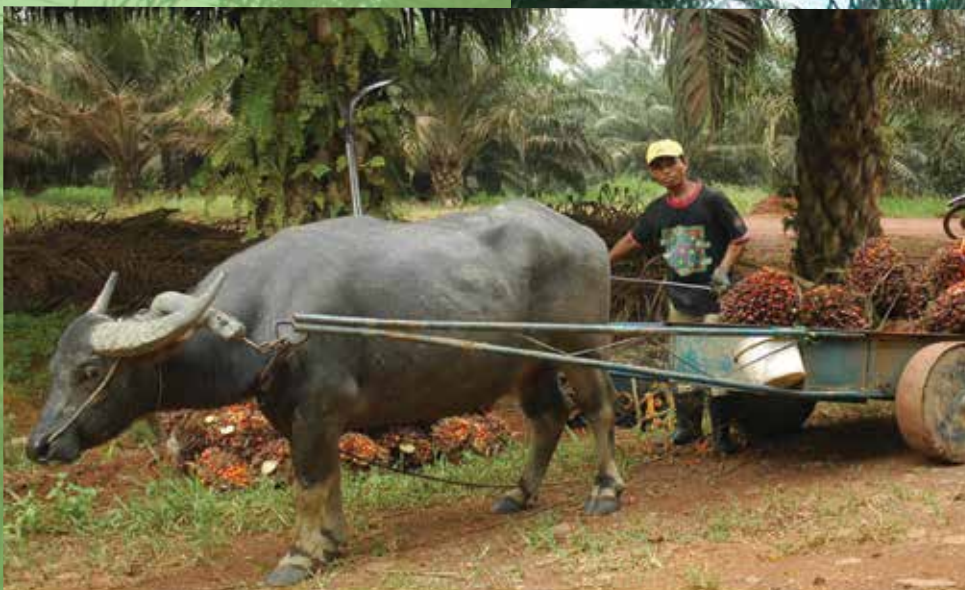
Harvested bunches are removed from palm bases with buffalo and cart to reduce fossil fuel use.