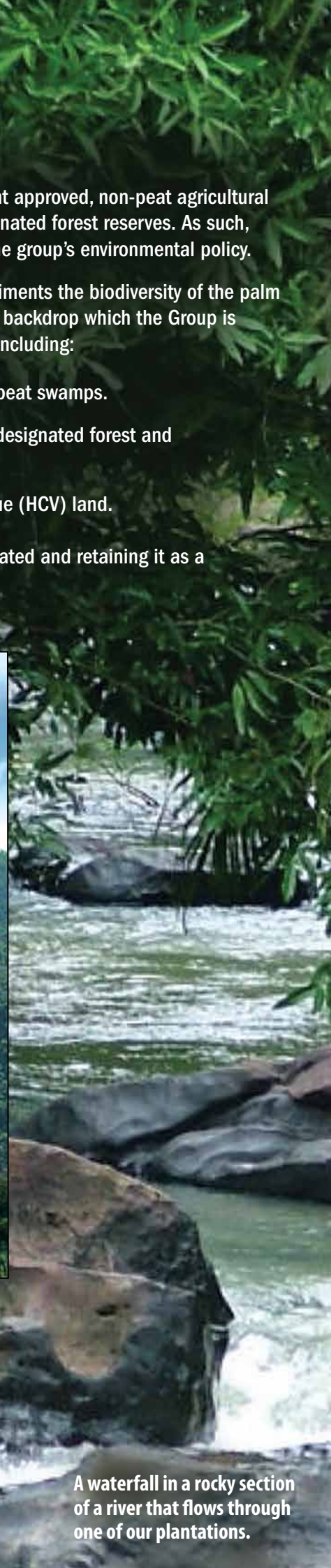
A waterfall in a rocky section of a river that flows through one of our plantations.