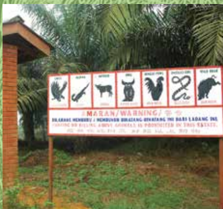
Hunting and fishing of wildlife are prohibited within our plantations.