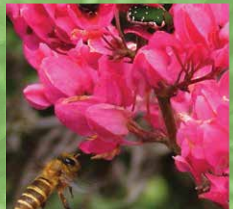
Wherever possible, natural solutions are found to deter pests.