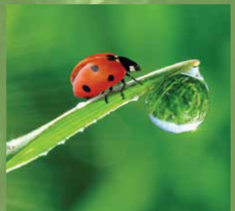
Plants and insects add to the overall biodiversity of the plantations, which are rich in flora and fauna.