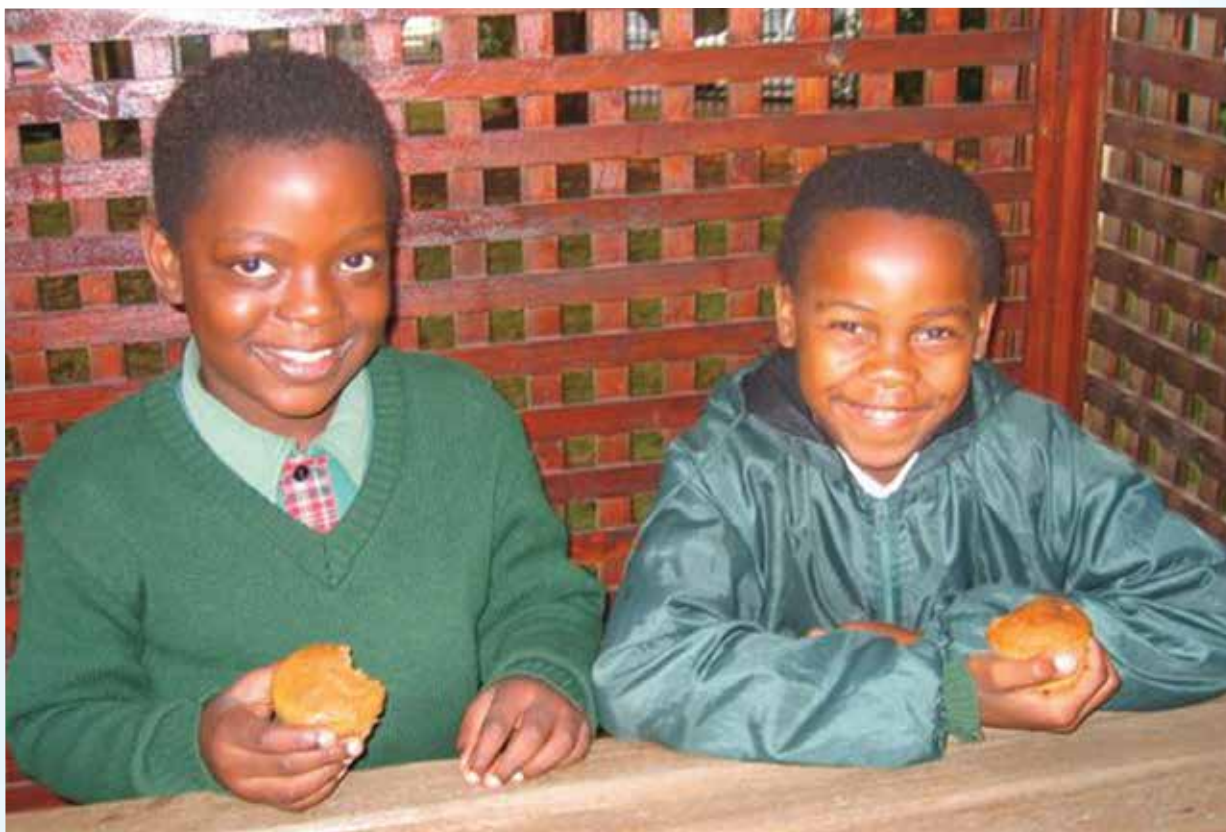
ABOVE: South African school children enjoying Carotino carotene-rich muffins.