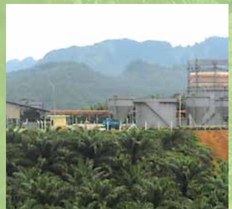
A dedicated biogas plant is used to generate power and reduce diesel usage at our mill.