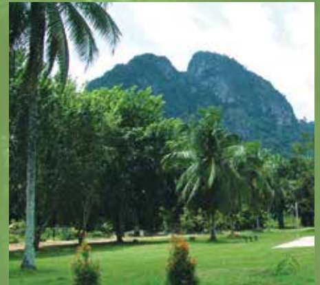
An open park area on one of our plantations.