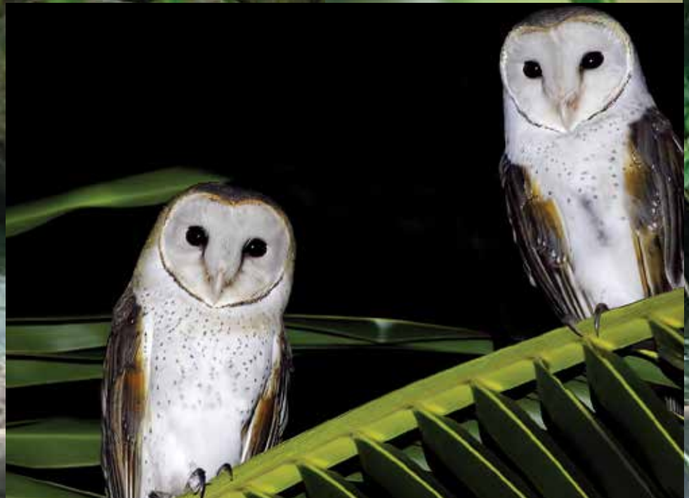
Top Right: Beautiful Woodland Basil Above: Barn owls are used to control pests. Some of the natural diversity of wildlife and plants that can be found in our plantations.