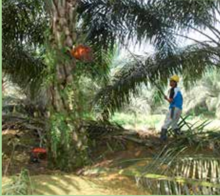
A plantation worker monitors palm trees on one of our sites.