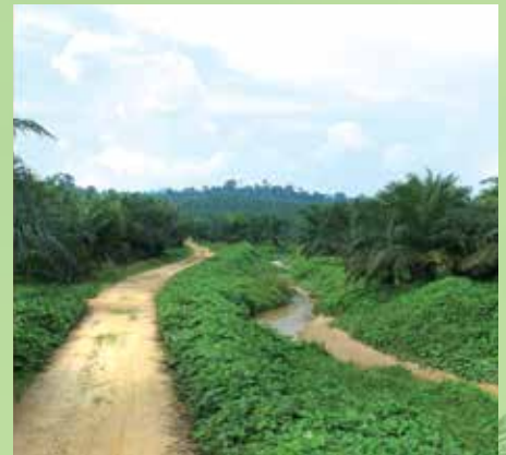
Drain sides are protected by luxuriant spread and growth of Mucuna Bracteata ground covers.