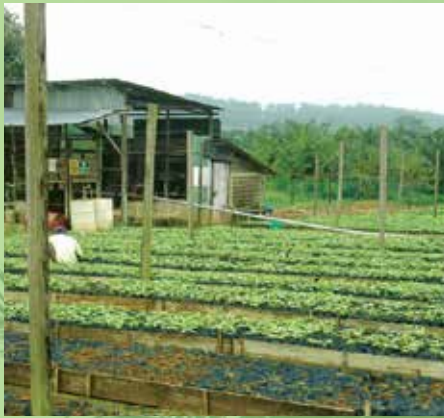
New plants are carefully reared on our plantations before being replanted elsewhere on the site.