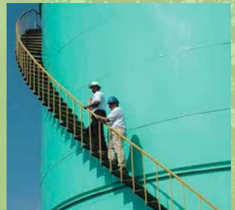
A routine daily inspection of one of our crude palm oil tanks.