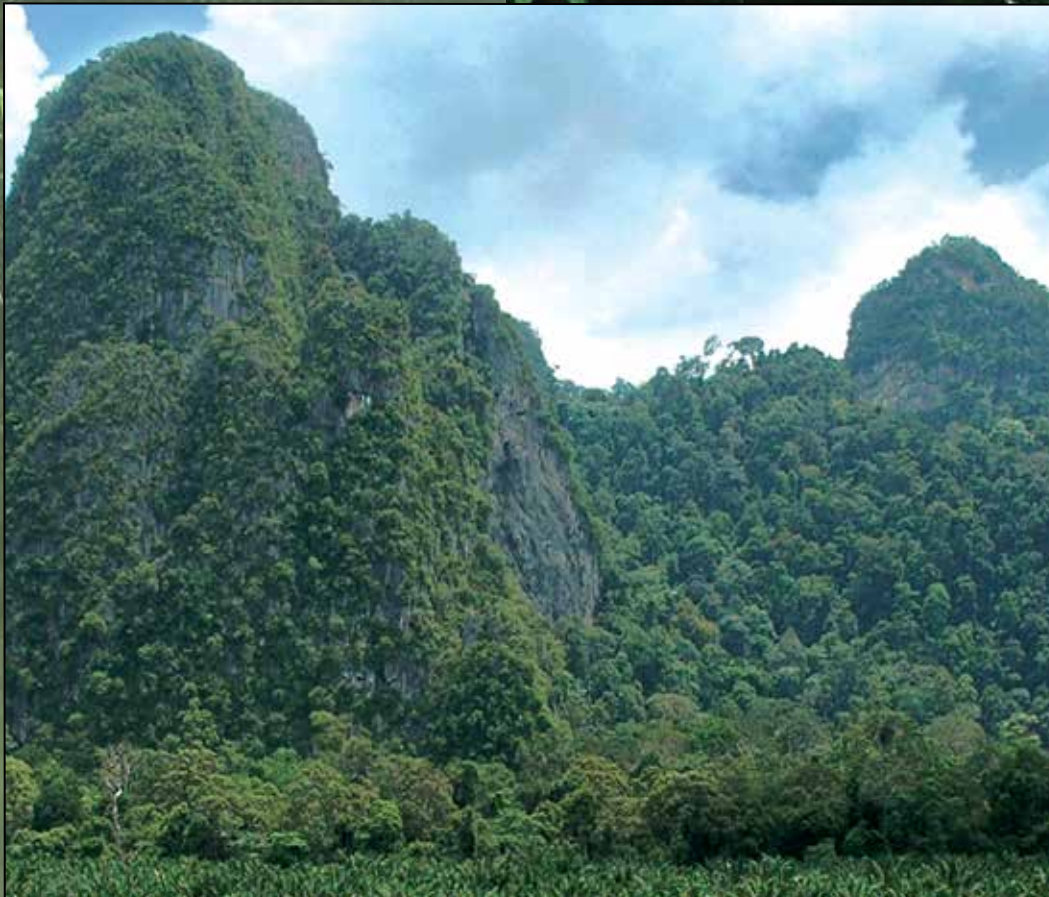
Above: Excessively steep terrain is left uncultivated.