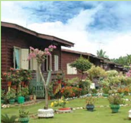
Plantation workers take great pride in their homes.