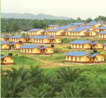
A workers village on one of the Group plantations.

The company provides a wealth of facilities which meet their needs, such as providing good quality housing, as well as catering for their educational, spiritual and social requirements.