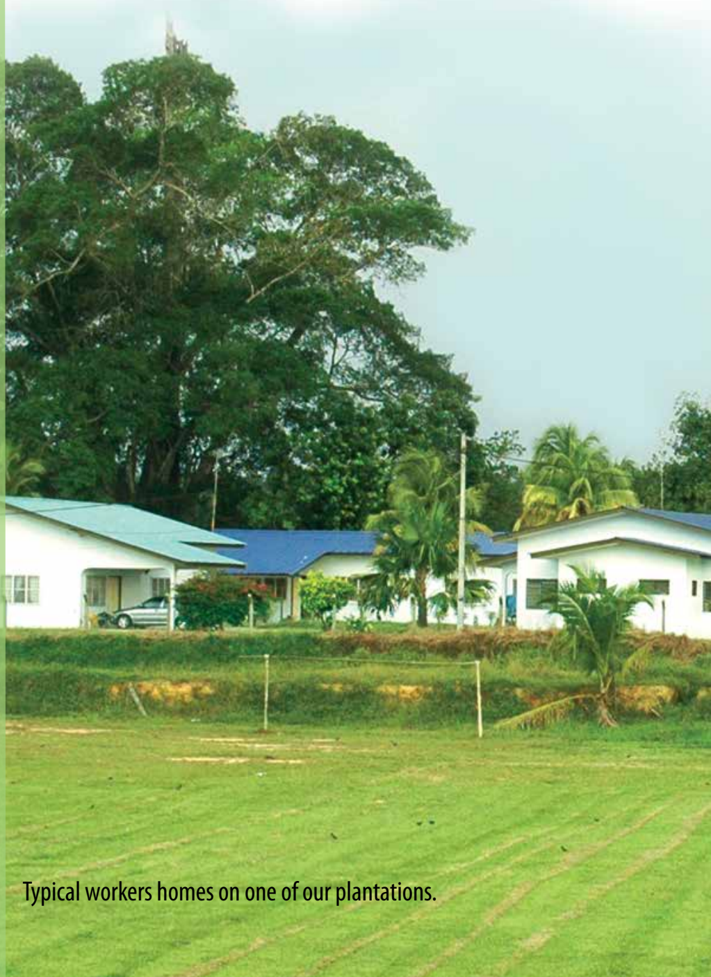
Typical workers homes on one of our plantations.