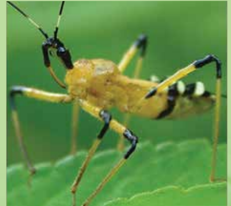
Predatory insects are encouraged to reduce pests naturally.