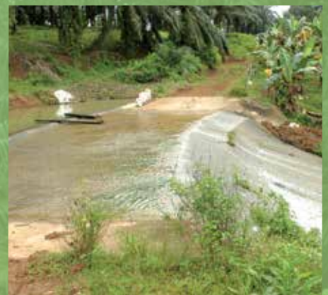
Rainwater is channelled into drainage ditches to preserve water for irrigation.