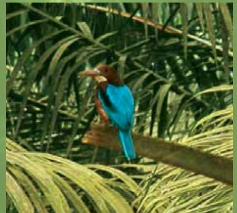
Palm plantations are home to many native species of birds and other wildlife.