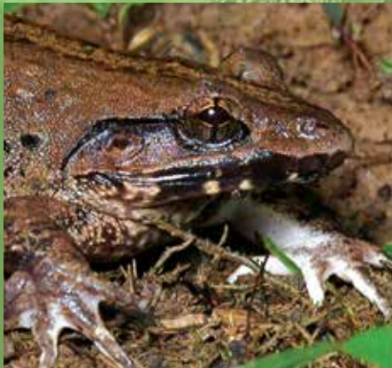
Bull-frogs are found in damp, low lying palm fields.