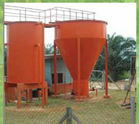
A water treatment plant to filter and treat water for consumption by the local community.