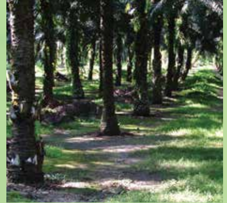
Beneficial grasses alternate with palm fronds to minimise soil erosion and maximise moisture conservation.