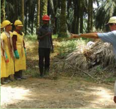
Workers are trained on the correct techniques of applying different types of fertilisers.