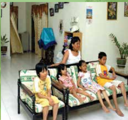
The spacious interior of a typical plantation worker's home.