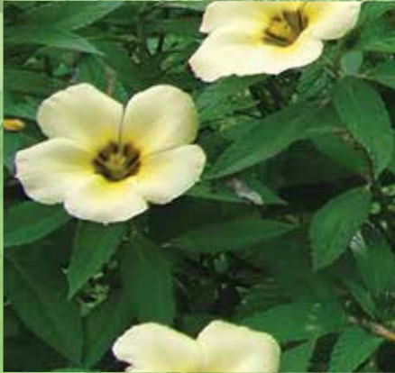
Tunera Subulata plants are the host plants of several predatory insects.

They also provide perfect habitats for many different plants, flowers and fungi which thrive among the trees and add to the unique biodiversity of the palm environment.