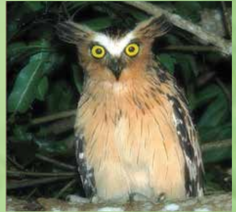
Owls are natural predators of rats and other vermin which can harm native wildlife.