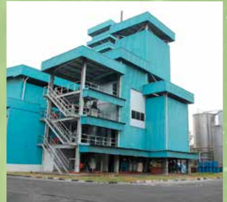
All Carotino/JC Chang's manufacturing facilities meet the highest international standards.

In 2014, a new Carotino Mill Biogas Plant was commissioned to reduce pollution and GHG emissions from mill operations. Biogas is formed from the decomposition of organic waste material and can be used to produce heat and electricity. It is considered a renewable fuel source and the construction of the mill is a further example of the Group's commitment to sustainability across its operations.