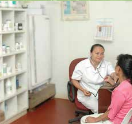
A well-equipped clinic provides for the basic medical needs of workers on our plantations.