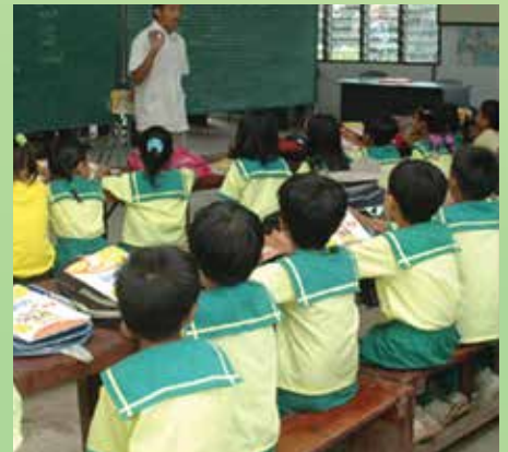
An enthusiastic class in one of our Humana schools.