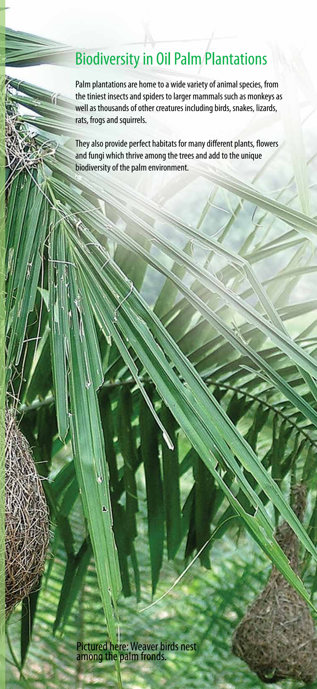
Pictured here: Weaver birds nest among the palm fronds.